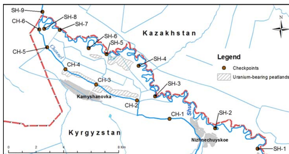
Figure 1 – Water sampling points in the territory of the Kamyshanovskoye field

Water was sampled as shown in figure 1 from 6 control points (CH-1 – CH-6) along one of the irrigation canals and at 9 control points along the Shu River (SH-1 – SH-9). The vast majority of these samples (14 out of 15) were taken on the territory of Kyrgyzstan. In Kazakhstan, only 1 water sample was taken at the control point (CP) SH-9.