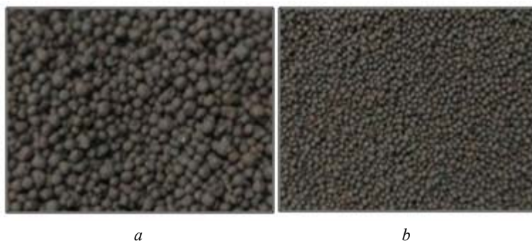
Figure 3 – Magnesian-silicate proppant obtained from overburden rocks, fractions: a – 16/20, b – 20/40

CMC 2% solution was used as binder. After drying in natural conditions, the granules fired in an electric furnace at 1300 °C, then subjected to fractionation and determination of properties.