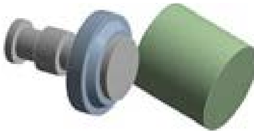
Figure 2 – Imitation of the process of rotational turning of wear-resistant cast iron ICH300H18G3.

Results. Figure 2 shows an imitation of the process of rotational turning of wear-resistant cast iron ICH300H18G3. The cutting tool is a cup made of P6M5 steel.