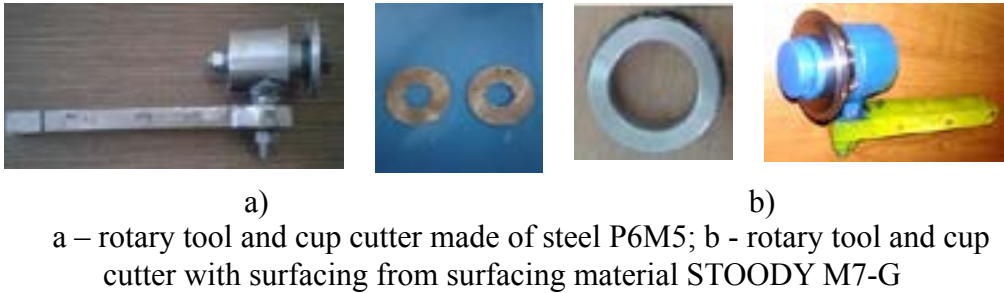
Figure 1 - Designs of rotary tools equipped with cup cutters made of P6M5 steel and with surfacing from surfacing material STOODY M7-G.

sliding speeds of the working surfaces of the tool relative to the material being processed without reducing the relative speed of the tool and part by replacing the sliding friction in the contact zones with rolling friction (Konovalov E.G. et.al, 1969).