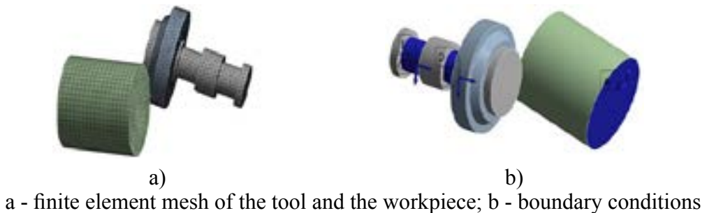
Figure 4 – Finite element mesh of the tool and the workpiece, boundary conditions

In the case when the fracture criterion is made, the criterion for the development of fracture comes into force. This criterion represents the energy level G_f necessary for the development of a crack. After a crack occurs, the behavior of the material appears to be the relationship between stress and displacement, and not between stress and deformation. For a scientific study of the cutting process, it is necessary to obtain the following information: contact force in the contact zone and temperature distribution in the workpieces (Bacaria J.L. 2001; Sherov K.T. et.al, 2018). A denser overlay of the finite element mesh allows you to get more accurate results in modeling physical processes, but it requires a lot of time. Therefore, always choose the ratio between the required accuracy and time constraints. In order to analyze the physical processes in the cutting zone, we show the surface of the workpiece in the cutting zone. Figure 4 shows the finite element mesh of the tool and the workpiece, as well as the boundary conditions.